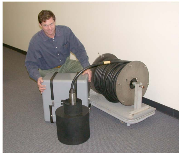
M-1210 Surveillance Sonar System Showing the Small Sizes of the Light Weight Portable Modules